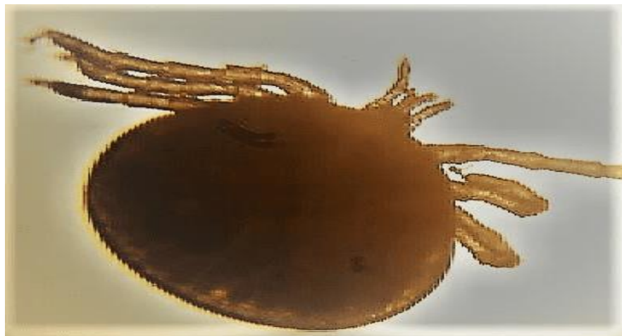
Figure 2: The larval stage of the external parasite (soft tick) Argas persicus (10X).

According to our findings, 13 % of 65/500 local chickens examined by postmortem inspection harbored gastrointestinal parasites, including multiple species of helminths, as seen in (Table 3). The prevalence rate of the majority of worms was (76%), (15%), (and 7%) respectively.