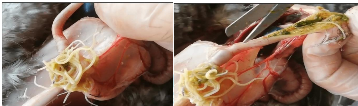
Figure 3: Ascaridia galli during postmortem examination.