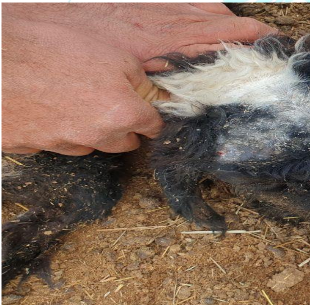
Table (1): Clinical values (Mean±SD) of sheep infested with s. ovis and control group.