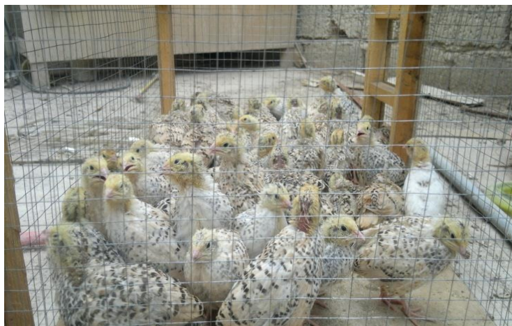
Figure1:Groups of apparently healthy quails reared in cages and used for identification of NDV.