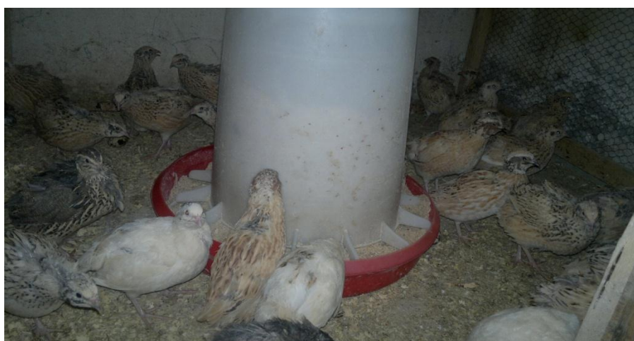
Figure 2:Shows quails feeding formulated as balanced ration.