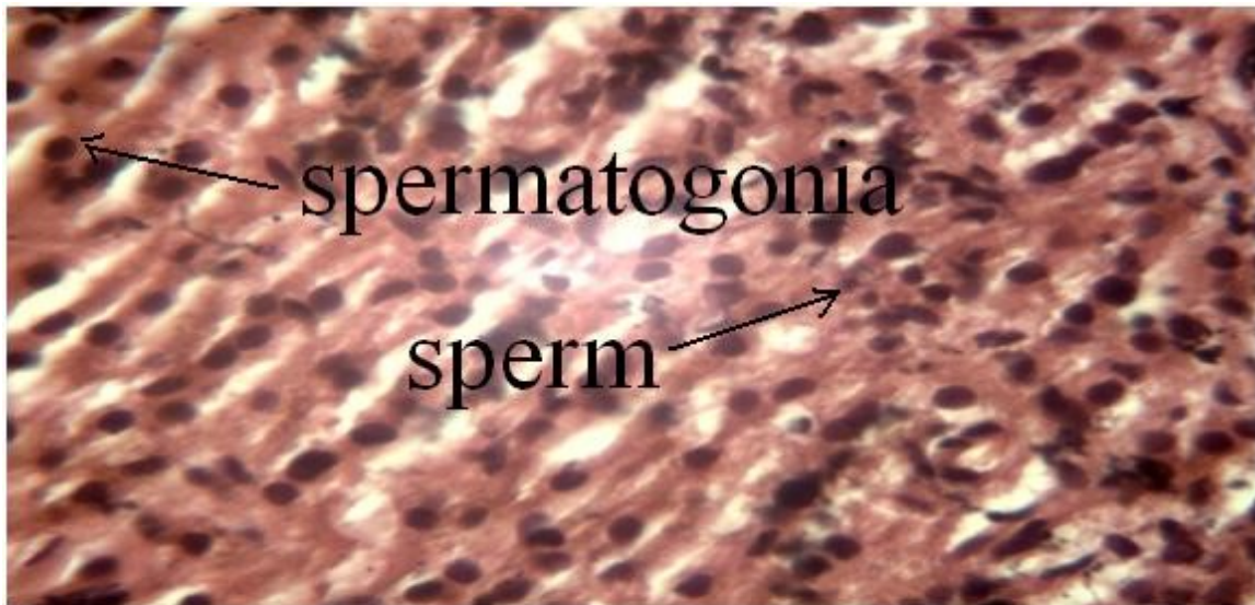
Figure (1): Open Biopsy Hypospermic Testis.