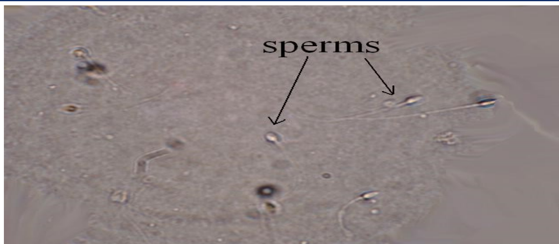
Figure (3): sperm retrievals.