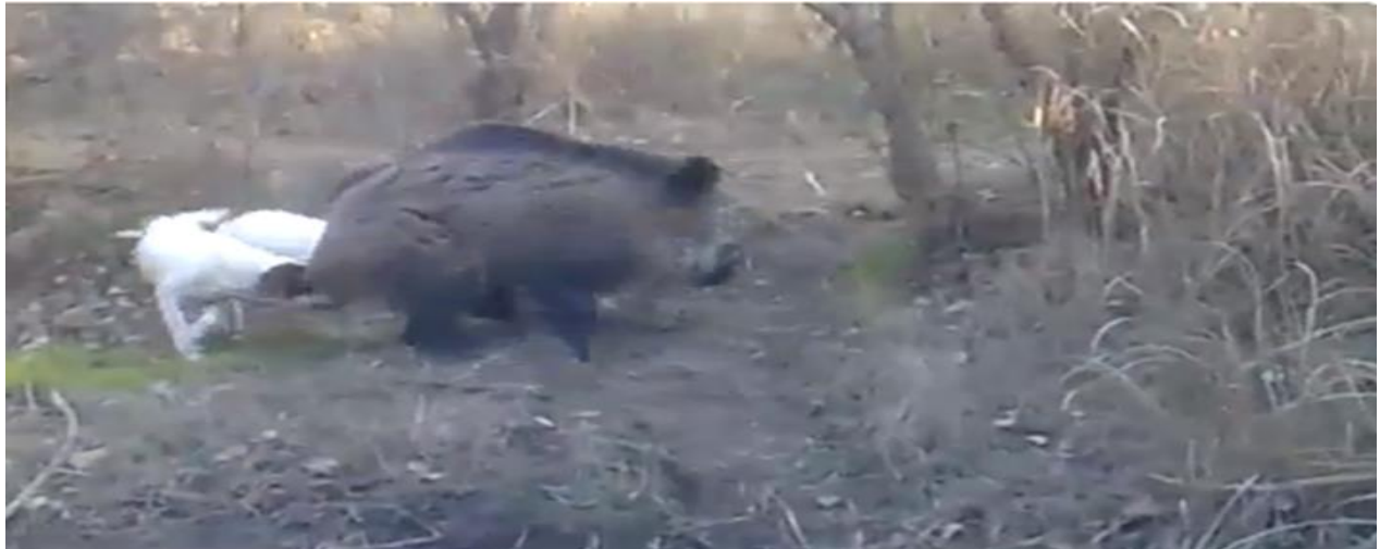
Figure 2. Live wild boar at the time of hunting. It was attacked by two white dogs at Al-Mugdadia, Diyala province