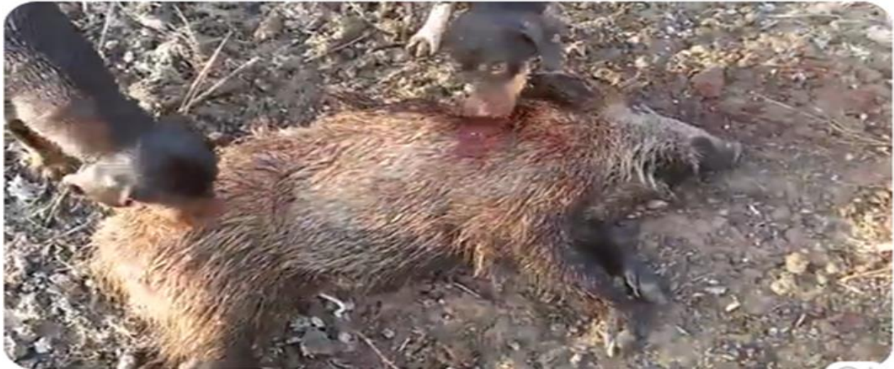
Figure 1. A hunted wild boar in Al-Mugdadia, Diyala province. Two dogs attacked the killed boar

The study was carried out from August 2016 to November 2017. Blood samples were collected from 51 cows, 34 sheep and 15 killed wild boars of different ages (Figure 1 and 2). Furthermore, tissue samples from lymph nodes, tonsils and trigeminal ganglion of 15 killed boars were collected, labeled and kept in -30 °C until use. These animals were distributed in different villages of different local towns of Diyala province and Al-Rahmania village of Al-Suwairah town of Wasit province (Table 1). 10 ml of blood from each animal were collected from Jugular vein using 5 ml size EDTA glass tubes.